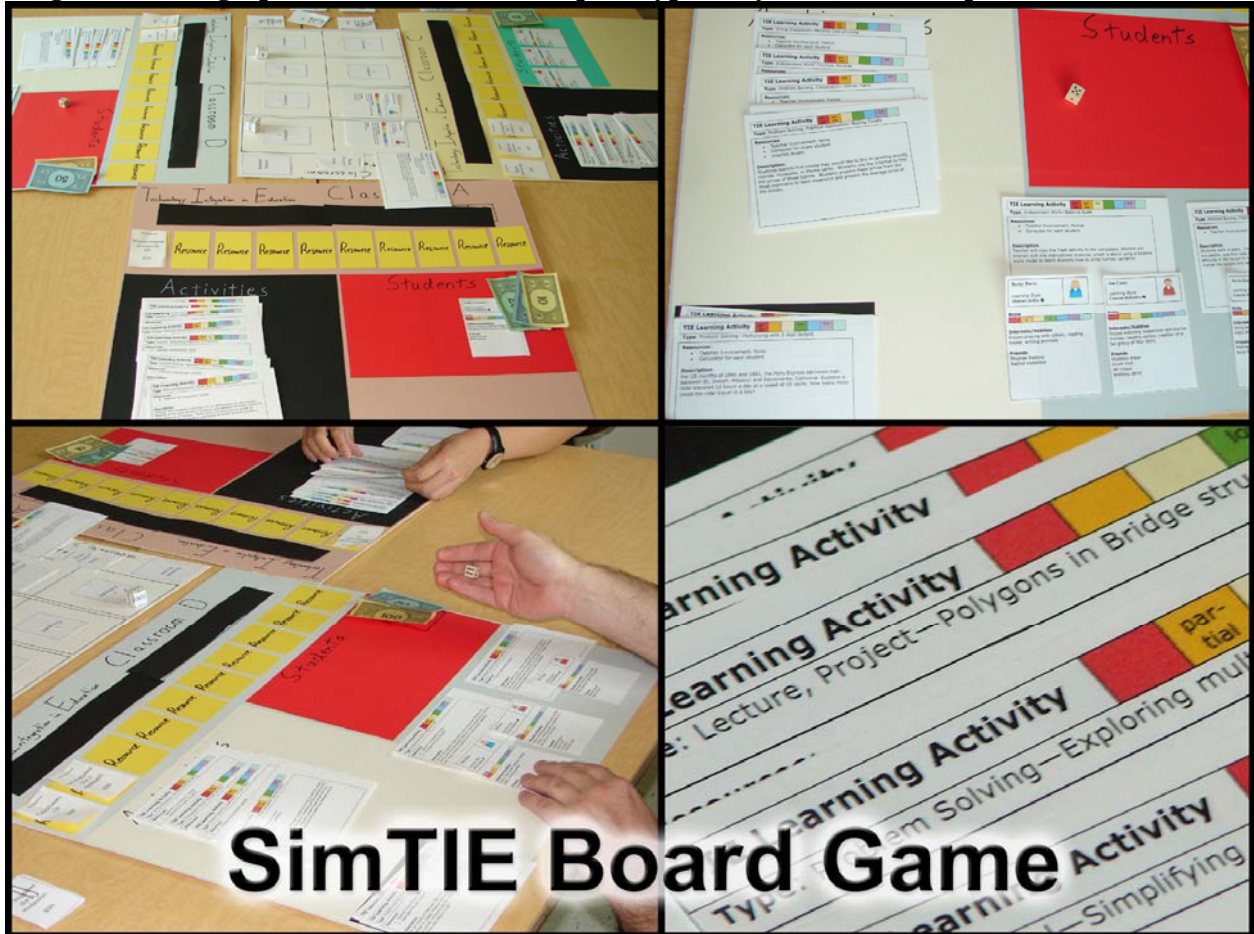
Figure 1. Photographs of the initial SimTIE prototype, May 2007, to be adapted for SimEd-Math .

called the Diffusion Simulation Game (DSG) (Frick, Kim, Ludwig & Huang, 2003). The DSG has been played by over 3,000 students at Indiana University during the past 5 years, and a limited version available to the general public has been played more than 4,000 times in the past 17 months. The principal investigator has also led the design of online learning about plagiarism that has received over 4 million page views in the last 3 years, with over 125,000 students passing the plagiarism test in 2007. We have reason to believe that well-designed and effective Web-based e-learning has great power and reach. We expect SimEd-Math to reach a very wide audience of both preservice teachers (our primary target audience) as well as teachers on the job.